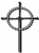
St Mary's, Olveston

The long running project to improve facilities inside the church has taken three big steps forward recently.